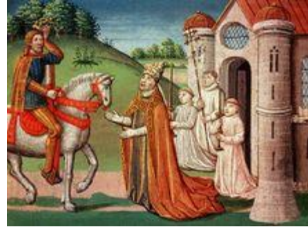
Charlemagne, King of the Franks